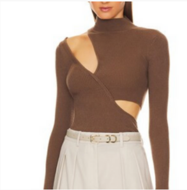
x REVOLVE Soraya Sweater Michael Costello $168.00

For the girl always up to day on the latest trends and styles. Whether it be the color of the moment (red) or embracing the comebacks of big boho bags and ballerina slippers This post may contain affiliate and sponsored content