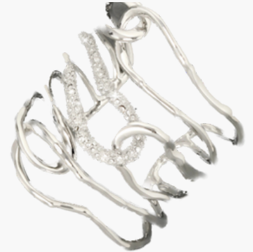
Alexis Bittar Rhodium Solanales Large Twisted Cuff Bracelet $395.00