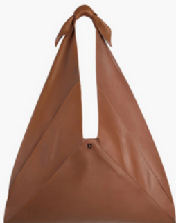
Eric Javits Farrah Bag $297