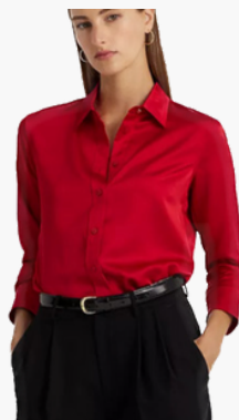
Satin Charmeuse Shirt $101.50