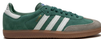
Farfetch Global Adidas Samba OG "Court Green" Sneakers $135.00