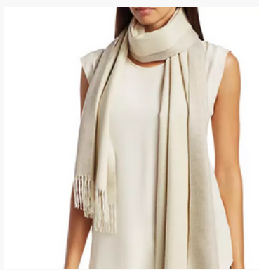
Loro Piana Two-Tone Cashmere Scarf $1,375