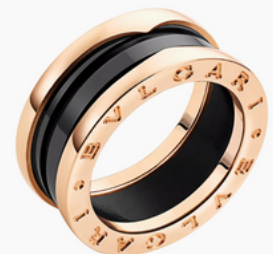
BVLGARI B.zero1 18K Rose Gold & Black Ceramic 2-Band Ring $1,950