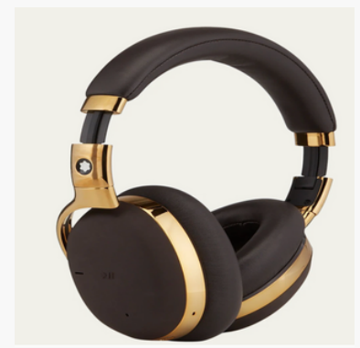
Montblanc MB 01 Over-Ear Headphones, $640.00