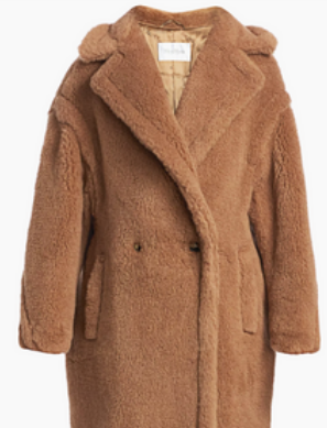
Max Mara Teddy Bear Icon Coat $4,390