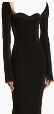
Khaite The Beth Dress in Black $1580