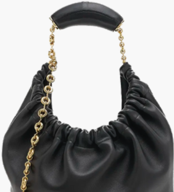
Loewe Small Squeeze Chain Leather Hobo Bag $3,950

This post may contain affiliate and sponsored content