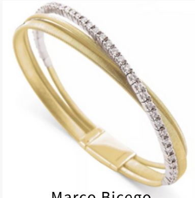
Marco Bicego 18K Yellow Gold Masai Diamond Crossover Bangle Bracelet $9,940.00