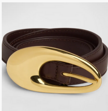
Bottega Veneta Drop Leather Belt $590